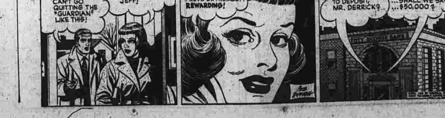
BY PETE HOFFMAN