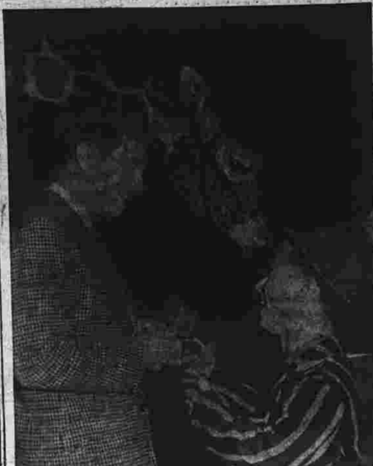
Bozo the Giraffe watches Joe E. Brown sign an autograph for one of the members of the "Timex-Bertram Mills Circus Show" which will be televised on ABC-TV, Thursday night, March 31. Brown traveled to London, England, the home base of the circus, to host the show which will star seven of the top acts in Europe.