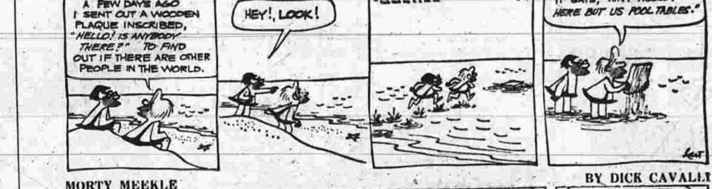
BY DICK CAVALLA