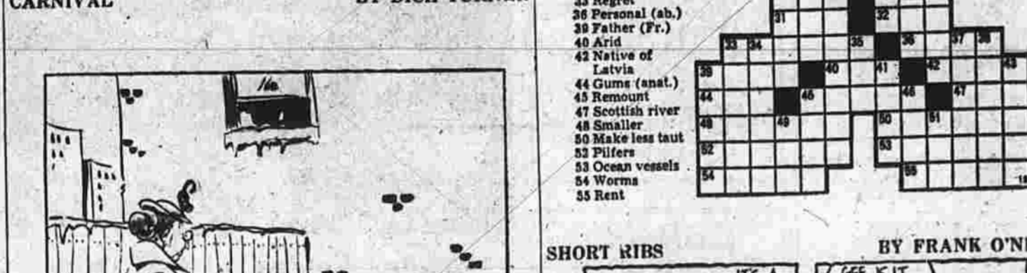
BY FRANK O'NEAL