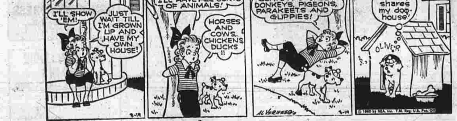
BY AL CAPP AND BOB LUBBERS