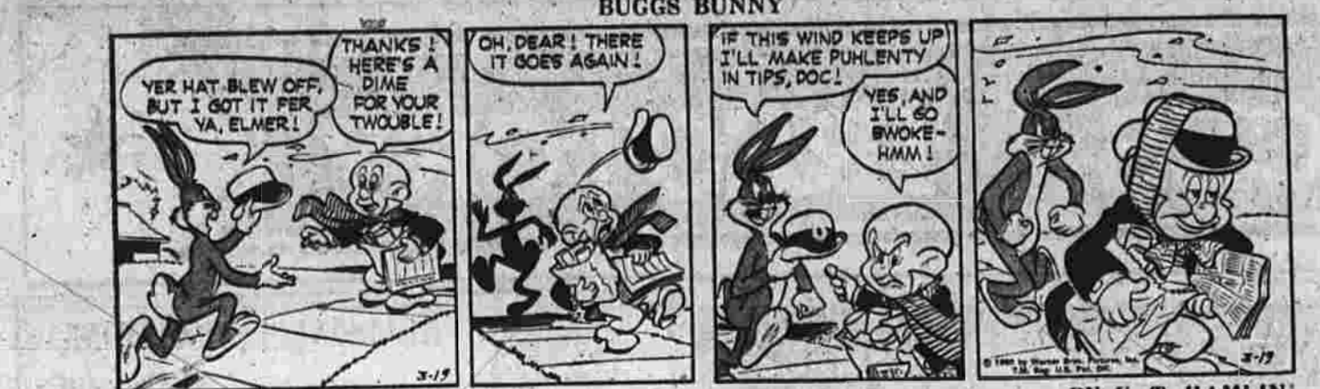
BY V. T. HAMLIN