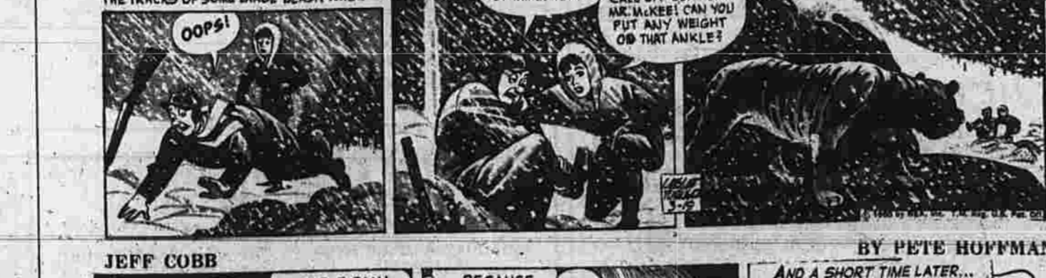
BY PETE HOFFMAN